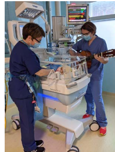
Jessie’s Fund is registered charity no. 1045731

Some five years ago, we started to plan music therapy projects in hospitals – plans which came to fruition in June 2018, when we established a music therapy post at the Great North Children’s Hospital in Newcastle, and at York Hospital. This was a pilot project which drew to an end just as the pandemic was taking hold. Though the decision to continue to support this work had already been made, it had to be put on hold. However, throughout the year there have been discussions with the hospitals about the best time to resume, and as the year came to a close we were preparing to advertise the posts again.